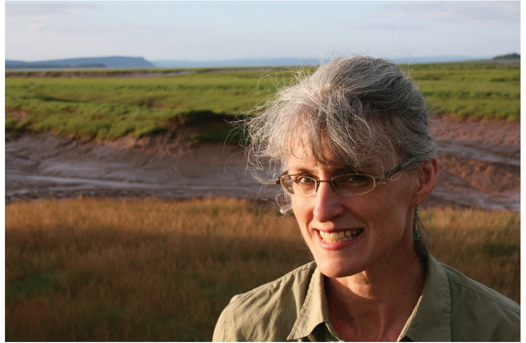
Author photos by Sandy Campbell 2009